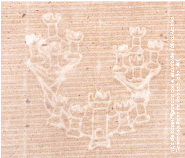
Hoja de papel filigranada con el escudo de Xàtiva. Archivo General del Reino de Valencia, año 1401

In October of 2009, the Institut Valencià de Conservació i Restauració de Béns Culturals and the Instituto del Patrimonio Cultural de España del Ministerio de Cultura, the Diputación Provincial de Valencia and Xativa's City Hall had organized conferences in Xativa regarding the important role that Spanish Arabic paper played as a writing ground support for the Mediterranean cultures during medieval times, and Xativa's protagonism for being the first Occidental population with a documentary evidence to possess paper industry.